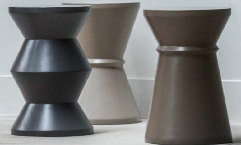
3 BROTHERS TEO, LEO & FRANK