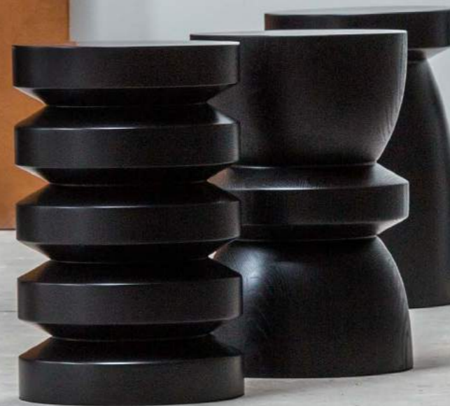
3 SISTERS LUCRETIA, LUCINDA & DOT